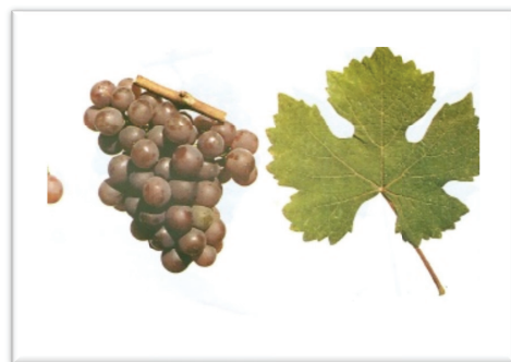
Figure 4. 'Traminer rosé' variety

In the case of the berries the similarity is higher than in the case of the 'Pinot blanc', the latter being similar for five out of the six characters. Thus, the shape of the berry, the skin thickness, the pulp colouring intensity, the degree of consistence of the pulp and the taste are similar, only the skin colour descriptor being different (225).