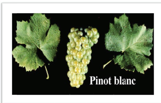
Figure 2. 'Pinot blanc' variety

In the case of the young leaf, the similarity is at the colour of upper side of blade (4 th leaf) - 051, and in the case of adult shoot of the two studied characters the similarity is complete, that is at the colour of the dorsal side of internodes and colour of the ventral side of internodes (007, 008).