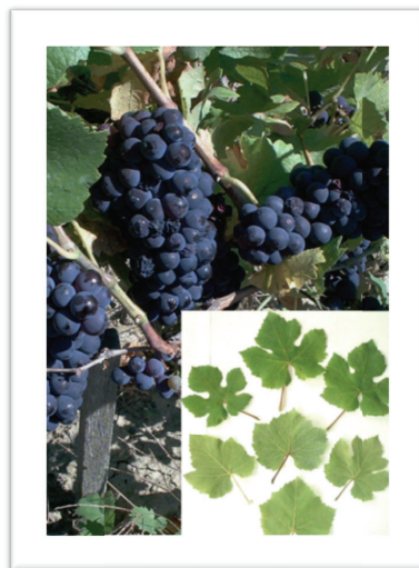
Figure 1. 'Pinot noir' variety

The variety with the highest degree of similarity is the 'Pinot blanc' (Figure 2) which has a number of 28 ampelographic characters common to the 'Pinot noir', (Figure1) having a degree of 75.67% similarity to it, as follows: in the case of the young shoot of the three studied