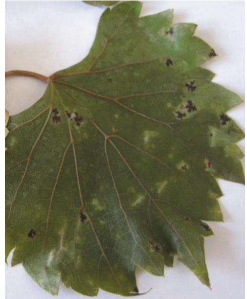
Figure 2. Initial symptoms of Isariopsis leaf spot on the adaxial leaf surface of Vitis rupestris du Lot

Pseudocercospora vitis (Lév.) Speg. (Ascomycetes, Mycosphaerellales), the anamorph of Mycosphaerella personata Higgins as described by Ellis (1971) and Harvey and Wenham (1972).