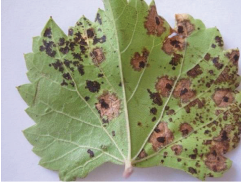
Figure 4. Leaves of Vitis rupestris du Lot, with leaf spots on adaxial surface, late in the season

observed on control plants. Fungal colonies morphologically identified as P. vitis were reisolated from lesions on inoculated leaf tissues, fulfilling Koch's postulates. Control plants remained symptomless.