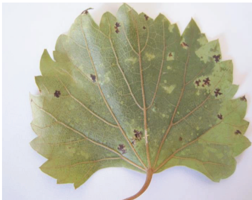
Figure 1. Irregular to angular chlorotic halos on the abaxial leaf surface of Vitis rupestris du Lot

surfaces - abaxial (Figure 1) and adaxial (Figure 2), and as the disease progressed, they were progressively turned purplish brown to black lesions. These spots later coalesced (amphigenous or confluent) reaching to 2 cm in diameter mostly with a serpentine and well defined outline encircled with dark borders or chlorotic halos on the upper leaf surfaces and became brittle with age (Figure 3). On the corresponding lower leaf surfaces, only the narrow centers of these lesions were brown to black but surrounding tissue was a large necrotic area (Figure 4). These coalesced spots caused leaf blight and premature defoliation. The disease incidence approached 30 to 50% on vines (cv. du Lot). The leaf spots were more severe on the leaves near the ground and progressed to the upper leaves. When infected tissue was examined under a stereomicroscope, typical cercosporoid hyphomycete structures were observed within the lesions on both leaf sides but mostly on the upper side. A slow-growing fungus was consistently isolated from the affected tissues after 5 days of incubation at 25°C.