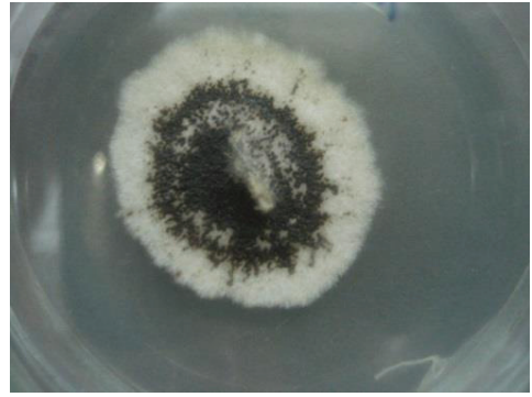
Figure 5. Colony of Pseudocercospora vitis after 30 days growth on potato dextrose agar

Cultural practices that increase air circulation such as shoot positioning and thinning may aid in management of the disease.