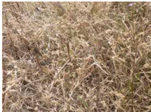
Figure 3. Crypsidetum aculeatae from area investigated

The phytocoenosis of these association have small plant species in composition. Next to the dominant one ( Crypsis aculeata - Figure 3) we meet Aster tripolium ssp. pannonicus , Taraxacum bessarabicum , Crypsis schoenoides , Trifolium fragiferum ssp. bonannii , Cynodon dactylon etc.