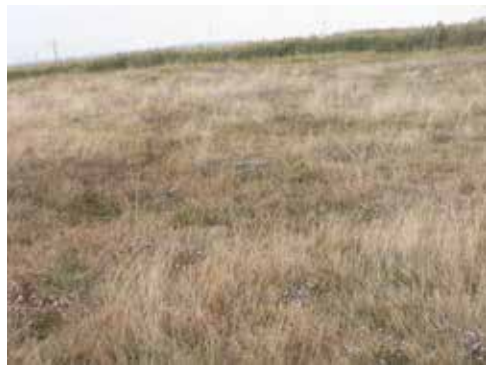
Figure 4. Puccinellietum limosae - autumnal aspect

Puccinellietum limosae Rapaics ex Soó 1933, 1936 (Figure 4) - is found in those places with higher moisture. The most frequent halophilic plant species in these phytocoenosis are: Lotus tenuis , Hordeum geniculatum , Trifolium fragiferum ssp. bonannii and Carex distans .