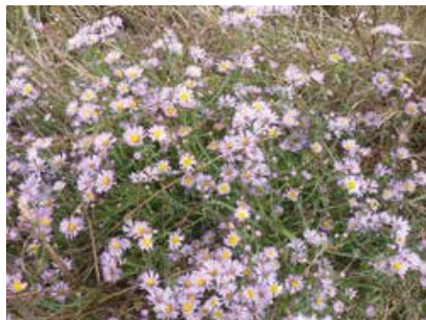
Figure 1. Aster tripolium ssp. pannonicus between Rastu Vechi and Rastu Nou localities

also by the aesthetics given by the color of these plant species flowers. In the lilac sea offered by Aster tripolium ssp. pannonicus (Figure 1) we find a yellow winding carpet given by Lotus tenuis to which fixation participates species like Trifolium fragiferum ssp. bonannii and T. repens , being speckled by their reddish and white flowers.