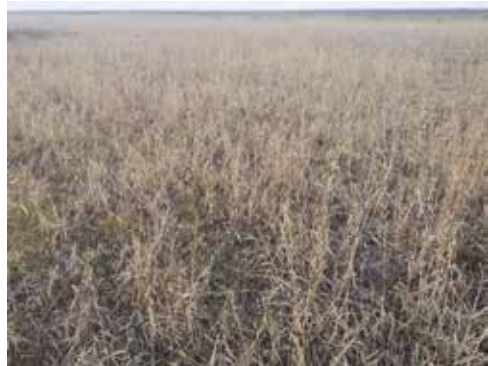
Figure 5. Areas where Phragmites australis ssp. humilis has a good representation

Phragmites australis ssp. humilis and Aster tripolium .