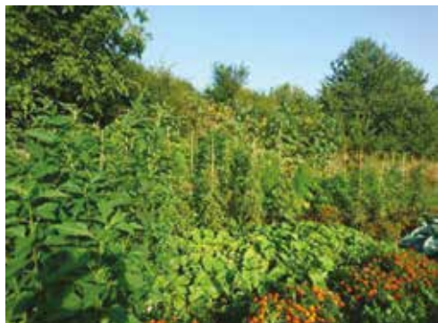
Figure 1. Garden detail

The obtained results regarding the ornamental value of the studied garden revealed that the ornamental vegetable garden has many functions, with beautiful perspectives. The usage of different intercropping systems (lettuce + runner bean; eggplant + pepper; okra + beans etc.) contributed in a positive way to the ornamental degree (Figure 1).