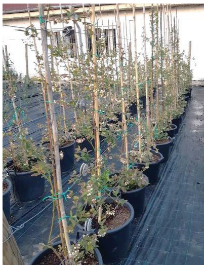
Fig. 7. Blueberry – individual support for vertical cordons and 4 wire in a single plan for trellising (Bucharest. 2018)

Moreover, in a project named “Innoberry” conducted at UASVM Bucharest, for the first-time blueberry grown in 65 l containers has been conducted with one or more vertical cordons using a single row of wires and individual bamboo sticks to maintain them upright.