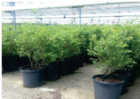
Fig. 12. Potted blueberries in the old unutilized greenhouse (Orlando, USA, 2016)

cycle. In the near future, a lot of unsuitable lands or plots for other purposes inside the urban and peri-urban areas can be transformed in production units as urban farms including the berry species as a very promising crops for fresh consumption.