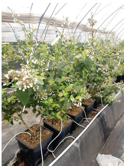
Fig. 11. Potted blueberries in the recirculating system for water and nutrients (Belgium, 2018)

The most expensive protection is given by greenhouses where, in most of the cases, for berry crops, the light, temperature, water and nutrition are fully controlled by devices and sensors. In modern high-tech greenhouses, recirculating system for water and nutrients (fig. 11) is successfully applied in berry crops as well as for common vegetables.