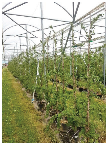
Fig. 9. Gooseberry crop under high-tunnel (Belgium, 2018)

A wide range of high tunnels construction types can be used for this purpose (Both et al., 2019).