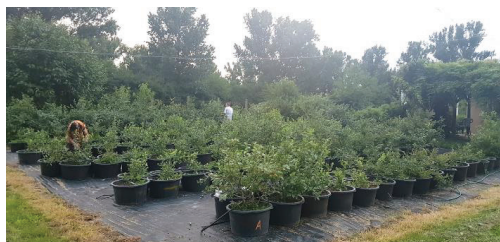
Fig. 2. Plastic pots of 65 l volume used for blueberry crop (Dambovita, 2018)

The common and convenient use of pots are made from solid plastic (fig 2).