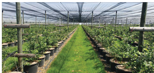
Fig. 8. Blueberry in containers under hail net with a double wire supporting system (Switzerland, 2019)

In order to become more independent and to avoid climatic unbalances that could affect the normal development of berries, a couple of protective systems have been designed and applied. For instance, outdoor berry crops need protection against hail and or birds (fig. 8)