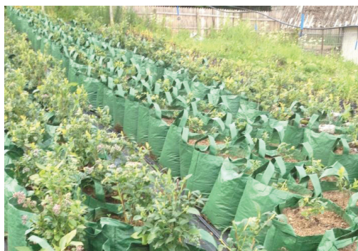
Fig 3. Blueberry crop in bag-pots (Bilcesti, 2014)

Sometimes, breathable bag-pots (fig 3) manufactured organically or from polyester are designed for growing ornamentals, vegetables or berries with the inconvenience of instability and substrate cracking.