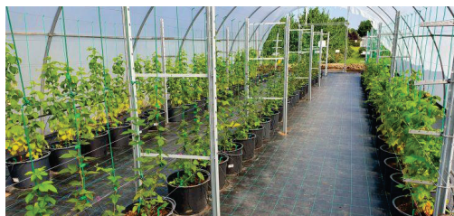
Fig. 10. Raspberry and blackberry in a plastic solar (Bucharest, 2019)

Similar protection can be assured by plasticulture (Imanishi, 2016). Classic solars represent an easy option for growers that aim to protect and/or advance the production. For berries, suitable solars are the ones larger and higher in order to permit a good ventilation and enough place for vertical growth of the canes (fig 10).