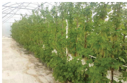
Fig. 5. Red currants grown in greenhouse – wire and bamboo trellising for vertical training of cordons (Belgium, 2018)

In the same direction concerning land use efficiency or better valorisation of a limited urban space, growing systems have evolved into vertical training systems of plants stems. But this can be done only supporting them with wires or by individual holders (fig. 5).