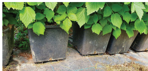
Fig. 4. Reshaped pots for a better use of space. Raspberry potted culture (Switzerland, 2019)

The shape of the pots is normally round with the higher diameter at the top-edge of the recipe. In urban horticulture and also in greenhouses, each square meter is very costly and valuable. In this respect, to make it more efficient, the plants can be grown in square pots (fig. 4) which are linear distributed along the row and collects more units/linear meter.