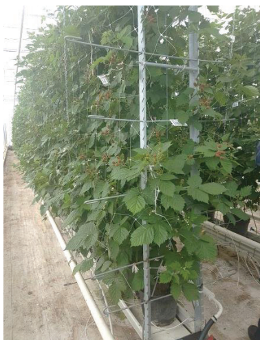
Fig. 6. Blackberry in greenhouse – two wire system with supporting net (Belgium, 2018)

Species like raspberry or blackberry that issue more canes from the pots during the vegetative season needs a double wire system (fig. 6) and a supporting net for the lateral fruiting shoots for a convenient fruit picking.