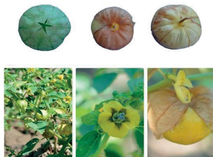
Figure 1. A1 crop detail and fruits images

Plant has indefinite growth, with erect habit and with an average internode length. The leaves have an average length of 5.8 cm and a width of 2.4 cm