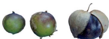
Figure 7. A7 crop and fruits images

The plant with an erect habit and a height of over 105 cm, the length of the internodes is average, and the leaves have strong edge ripples, the flowers are large, over 2.6 cm, 13% more than the L6. The length of the internodes increases with the height of the plant. The fruits do not have anthocyanin colour on the calyx.