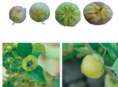
Figure 2. A2 crop detail and fruits images

Plant has an erect habit and with a height of over 50 cm, the height of the stem to the first branch and the length of internodes is 20% lower than A1. The anthocyanin coloration of internodes is medium. The leaves are shorter by 27% compared to A1. The genotype is noted for its earliness, its fruit reaching maturity 74 days after germination period.