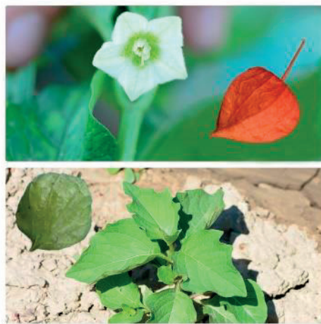
Figure 5. A5 crop detail

The plant has a height of over 40 cm, and the stem has up to the first branch, on average, 1.9 cm.