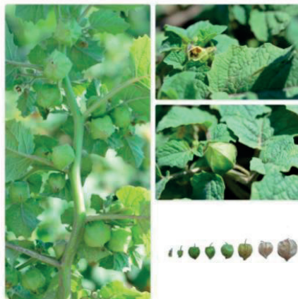
Figure 4. A4 crop and fruits images

pulp is greenish-yellow compared to orange on A3. A4 is productive; it forms a very large number of fruits, but with a low weight (1.6 g/fruit) and with a high TSS content, 11.19° Brix.