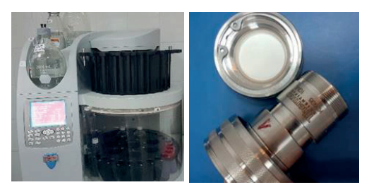
Figure 3. ASE 350 system and extraction cell

The seed sample was minced to 1-2 mm. For accelerated solvent extraction method, the sample was mixed with diatomaceous earth. The sample: diatomaceous earth ratio used was 4: 1. ASE 350 model equipment was used (Figure 3).