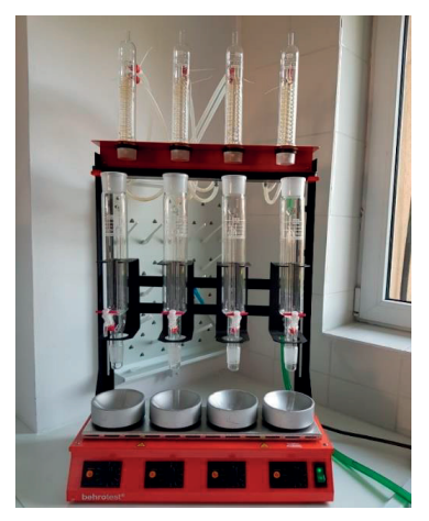
Figure 1. Soxhlet extraction system

et al., 2011), flavonoids (Kaleem & Ahmad, 2018), anionic surfactant removing (Rowe, 2010), foods (Hammond, 2003), phenols (Luque de Castro & Priego Capote, 2010) etc. This method is based on a large difference between the boiling points of the solvent and those of the extracted analytes.