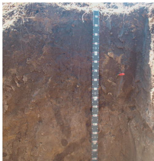
Figure 1. Haplic Chernozems with high biological activity

The studied sites are located in the residential area of Iasi city (North East of Romania). We studied several locations in the urban area of Iasi. In each location we studied topography and realized several soil profiles. The representative soil for the studied area is Haplic Chernozems (Figure 1).