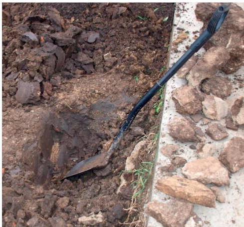
Figure 3. Strong compacted soil with artefacts and stones

In our studies we frequently find high proportion of artefacts (Figure 3) such as bricks, concrete, bricks, concrete, pieces of iron, nails.