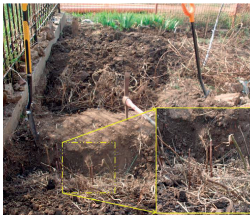
Figure 5. Reclamation works of the strong compacted Urbic Technosols by soil loosening and incorporation into the soil of the plant stems for providing vertical drainage

The restoration of compacted soils on the depth of 0-50cm could be done by the spading works and incorporation of the plants stems fragments (Figure 5).