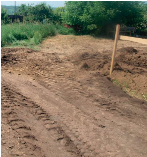
Figure 2. Covering the surface of the land with subsoils material followed by strong compaction

In our studies we frequently find high proportion of artefacts (Figure 3) such as bricks, concrete, bricks, concrete, pieces of iron, nails.