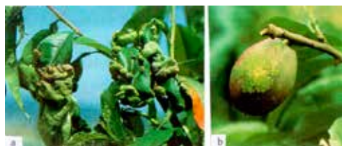
Figure 1. The blistering of the leaves - Taphrina deformans : a) Symptoms on the leaves; b) Symptoms on the fruit

Observations were carried out concerning the behaviour of certain peach tree cultivars towards the attack of the main pathogen agents: Taphrina deformans Berk et Tull, Cytospora cincta Sacc, Monilinia laxa and Monilinia fructigena Aderh Ruhl Honey. Taphrina deformans causes the blistering of the peach tree's leaves (Figure 1).