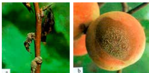
Figure 2. Monilinia :

Cytospora cincta , which causes the perennial cancer of the sprouts is generalised in peach tree crops which have suffered injuries on the bark of the sprouts as a result of other pathogen agents' attacks, such as Taphrina deformans or fusicoccum, the attack of insects or hits caused by hail. Cytospora installs itself on the already existent wounds and continues its attack on the branches; subsequently, the bark and the wood becomes dry and in some cases ulcerations occur. Monilinia laxa , which causes moniliosis or the monilial drying of the branches manifests itself during spring on all aerial organs of trees of all ages through the withering of the flowers and the drying of the vegetative buds and the sprouts, being accompanied by gumma leakages (Figure 2).