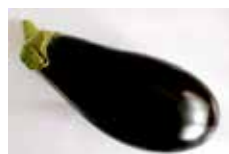
Figure 1. Mirval F1 cultivar

During the two years, the biological material used was three new hybrid cultivars of eggplant peas Mirval, Aragon and Black Pearl (Figures 1 and 2).