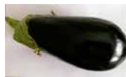
Figure 2. Black Pearl F1 cultivar

An experimental protocol was proposed to achieve optimal nutrition, using Nutrispore® fertilizers, Micoseeds® compared to a control, unfertilised. The combination of the two factors resulted in nine experimental variants. The experiment was a polyfactorial design, in divided plots with three replicates per variant, the area of a replicate being 7.4 m 2 , corresponding to 18 plants per replicate.