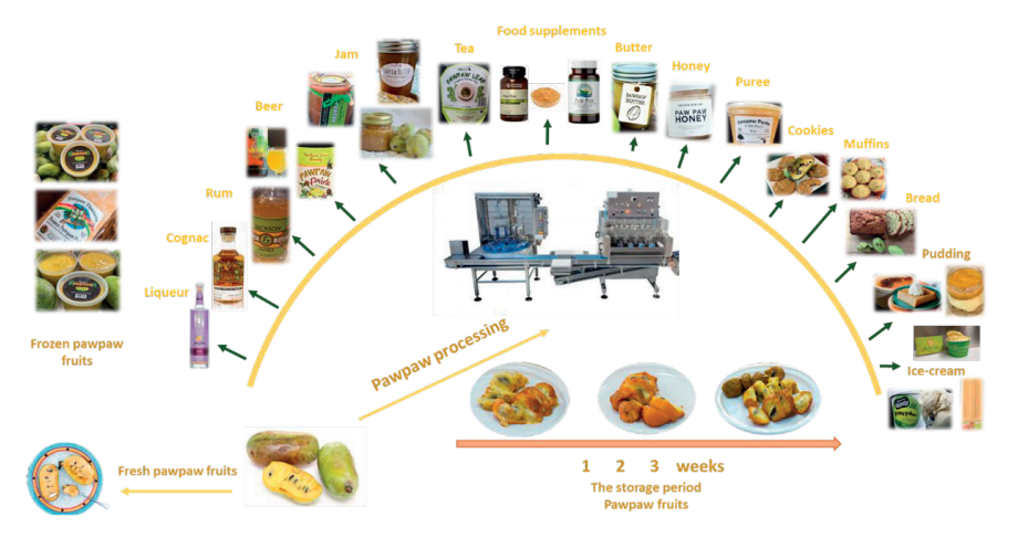
Figure 2. Processing of pawpaw - Source: Original

Pawpaws varies in flavor and intensity. The sugars in pawpaws are converted at high temperatures into caramel or butterscotch flavours, so the browner the cookies, the more these flavours develop at the expense of the pawpaw flavor. In the Figure 2. are presented most of all the possibilities for storing and processing pawpaw fruits.