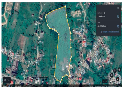
Figure 1. Location of the experience

The aim of research was to observe and evaluate the phenological and morphological traits of the old apple cultivars using the following observation of flowering phenology traits and the classification of the cultivars into flowering time groups.