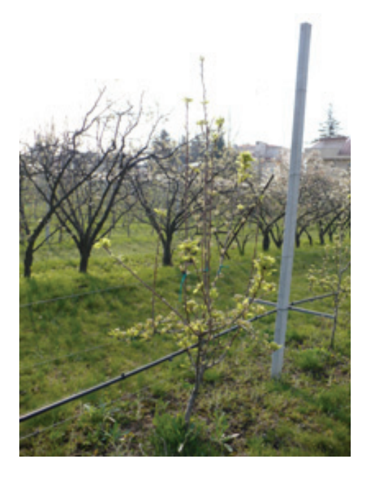
Figure 1. T-4 wire support system

There were used two support systems, one namely T 4- wire with galvanized wire (figure 1) and the other with two wire and three bamboo tutors/tree (figure 2).