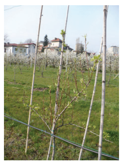
Figure 2. Two wire and three bamboo tutors

The alleyways were cultivated with perennials and were mowed mechanical in the growing season. On tree row the soil was maintained clean of weed by hand and mechanical cultivation.