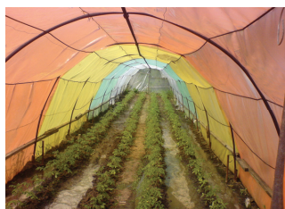
Fig. 1. Care treatments for tomato

Seedlings were produced in heated nurseries, according to known technologies [2]. Seedlings were planted in photo selective covered greenhouses, as soon as the soil temperature was 10-12°C. The establishment of crops, by tilling seedlings, was made on 08 April 2009, by the 70/35 cm scheme, resulting a number of 4 plants / mp (Fig.1).