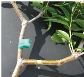
Figure 2. A) Control; B) Girdled branch

Girdling was performed for five other genotypes: R2P10, R2P11, R3P9, R3P6 and R2P5 by removing a bark strip of 5 mm wide from lateral fruiting branches. The same number of similar ungirdled branches was used as control (Figure 2).