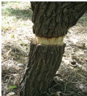
Figure 1. Girdled trunk of jujube trees

Girdling. At the beginning of flowering season, girdling was performed for three genotypes: R1P8, R2P5 and R3P5 by removing a circular bark strip from around the trunk with a girdling knife (Figure 1).