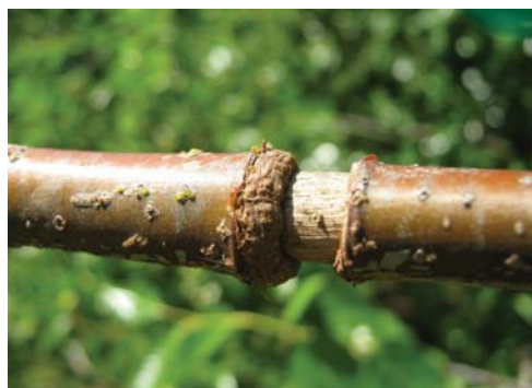
Figure 4. Callus formation above the girdle area after two months from girdling

All the girdled branches developed thick callus above the girdle (Figure 4), but there were no significant differences in branch diameter growth for girdled branches compared with control.