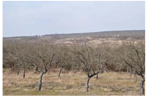
Figure 10 In the foreground abandoned apple trees orchard and in the background forested plum trees orchard at Farm No.2 Ticvaniu Mare (original)

As a short term effect on Ticvaniu Mare's agricultural landscape, there was a great fragmentation of the arable landscape and a great diversity of land mosaic with a growing trend in land abandonment because of a weak agricultural reform. As for the great potential of fruit farms (they were in full economic production), even if the land was returned to peasants property, they didn't have the specific technology and knowledge to continue production. As a result, on a medium term, the fruit farms declined and turned into almost forested areas (Figure 10).