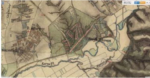
Figure 2 Ticvaniu Mare. The Second Military Survey 1806-1869 ( http://mapire.eu/ )

new colonized villages but also Romanian and Serbian typical villages. The house was to be placed perpendicular to the street so that the access inside was protected. Not only the house and its relation to the street was affected by the new regulations, but also the village structure, circulations became more coherent and houses got in better relation to them (Figure 2).