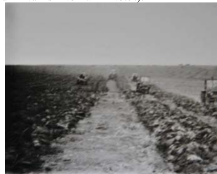
Figure 7 Land preparing for tree planting. Plot P1, 1976

In 1976, the Agriculture Co-operative for Production (CAP) Ticvaniu Mare plants the first plot with orchards (P1) (Figure 7) having a total surface of 28 hectares (13.852 trees) and during 1977-1978 plantings in P1 continue and the second plot (P2) is planted with a total surface of 93 hectares (76.500 trees). In 1977 The Economic Inter-cooperative Fruit-growing Association is founded and the orchard surfaces are turned into farms (P1 turns into Farm No.1 and P2 turns into Farm No.5.).