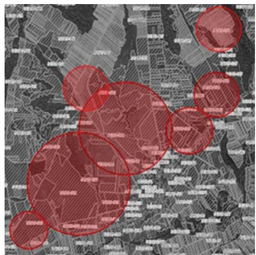
Figure 11. Large farms on Ticvaniu Mare's territory