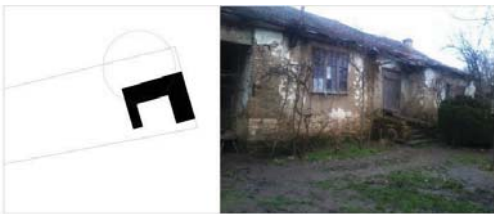
Figure 3 Typical clay house of a 19 th century peasant with later extension at street side (original)

Village architecture is well related to community occupations and the level of welfare. A quick analyse on Ticvaniu Mare architecture reveals different periods in the village history, most of them connected to agriculture. The analyze of Ticvaniu Mare's Second Military Survey map, reveals a quite dense compact village, with the plots orientated perpendicular to the street (Figure 3), with a very strong axis (the road from Resita to Gradinari). All the houses have small cultivated gardens. Romanian peasant's agriculture techniques are described to be poor, and they cultivate only some roots and few plants for eating (Griselini, 1984).