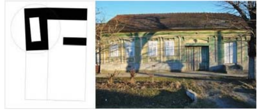
Figure 4 House No. 342. Typical compact house of a rich peasant 20 th century (original)

well protected. The crop garden is outside this ensemble (Figure 4).