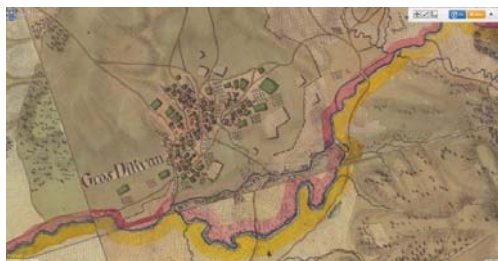
Figure 1 Ticvaniu Mare. The First Military Survey 1763-1787