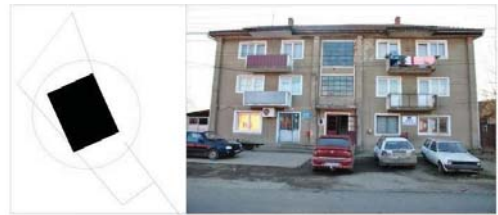
Figure 5 Block of flat for agriculture engineers, 1979 (original)

All these coherent structure and architecture was brutally completed during communism period with technological/urban architecture such as the Machine and Tractors Station (SMT), the Veterinary Centre, animal stables or the engineer's block of flat. In 1971, People's Council of Caraş-Severin County orders a research for architectural solutions in rural areas in Caraş-Severin County. The project No. 255 Research about housing in rural areas is accomplished, offering 10 architectural solutions in accordance with different cultural landscapes (Unit for Planning in Caraş-Severin County, 1972). Nevertheless, few years later the project No. 1645 orders the construction of a six apartments block of flat that should be finished until 1979 (Figure 5).