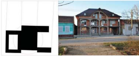
Figure 6 Typical continuous house front interrupted by a new out of the scale house, 21 st century (original)