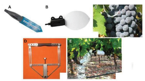
Figure 4. Some sensors employed in wireless sensor networks for proximal sensing in vineyards. (A) Soil moisture (Spectrum Technologies Aurora, IL, USA). (B) Leaf wetness (Decagon Devices Inc. Pullman, WA, USA). (C) Grape temperature. (D) Dendrometer (GMR Strumenti SAS Scandicci, Italy). (E) Sap Flow (Fruition Sciences Inc., Montpellier, France) (Matese and Di Gennaro, 2015).

A wireless sensor network for precision viticulture (Figure 4): The NAV (Network Avanzato per il Vigneto - Advanced Vinevard Network) system is a wireless sensor network designed and developed with the aim of remote monitoring real-time and collecting of micrometeorological parameters in a vineyard. The system includes a base agrometeorological station (Master Unit) and a series of peripheral wireless nodes (Slave Units) located in the vineyard. The Master Unit is a typical single point monitoring station placed outside the vinevard in a representative site to collect agrometeorological data. It utilizes a wireless technology for data communication and transmission with the Slave Units and remote central server (Matese et al., 2009).