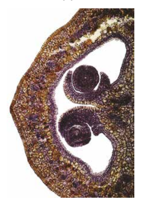
Figure 6. Histological representation of the morphological and anatomical structure of a portion of the ovary in 'Žilavka'. The ovule develops in the interior of the ovary and has marginal placentation. Later on, the ovule develops into a seed. The cross-section shows the ovule the size of a small bulge covered by the integument

The analysis of inflorescence and flower differentiation in the tested varieties is consistent with the findings of Caporali et al. (2003) who reported that functional differences between the (male and female) flowers are commonly recorded at this stage, when no style and stigma formation occurs on the pistil of male flowers. Due to these morphological changes, the pistils of male and female flowers are quite different at the next stage of development, whereas their stamens still remain very similar in appearance.