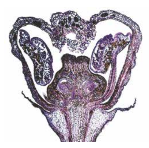
Figure 3. Microstages of flower differentiation in 'Blatina'. At this microstage of flower primordium development, the final stages of microsporogenesis and initial stages of macrosporogenesis are observed

The results on the dynamics of flower differentiation in the inflorescences of 'Žilavka' and 'Blatina' grapevines, as observed on the histological slides, are in complete agreement with the flower differentiation dynamics reported by Caporali et al. (2003) based on the classification proposed by Mulins et al. (1992). The cross-section through the center of the flower shows the position of the anthers relative to the petals and the manner in which the petals fuse to form the flower cap in the studied varieties. Minor differences are observed in the length of the fusion zone between the varieties (the fusion zone being somewhat longer in 'Žilavka' than in 'Blatina'), which can affect the rate of cap detachment during bloom (Figure 4 a, b). The center of the flower is occupied by the pistil made up of two fused carpels - microsporophylls. The ovary is bilocular - it consists of two chambers, each containing two ovules.