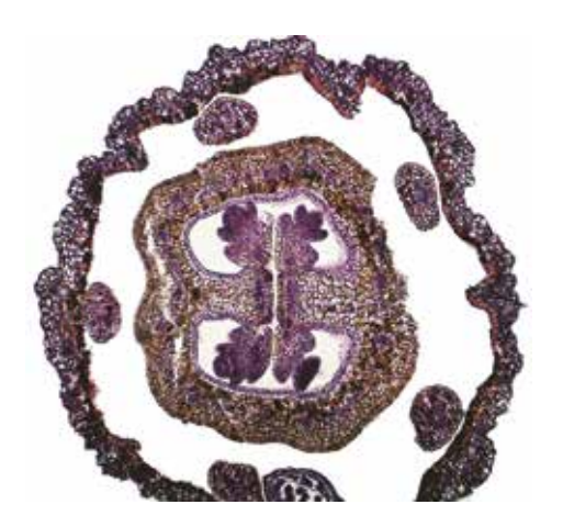
Figure 5. Histological representation of the cross-section of the bottom third of an individual flower, in 'Žilavka'. The cross-section displays the formed ovules at the integument differentiation stage. Cross-sections of the filaments are visible in the zone between the ovary and the petals. The cross-section of the filament in 'Žilavka' clearly shows epidermal and parenchyma cells located at the periphery of the filament and somewhat smaller central cells of the vascular tissue). This anatomical structure of the filament is typical of bisexual flowers in the grapevine