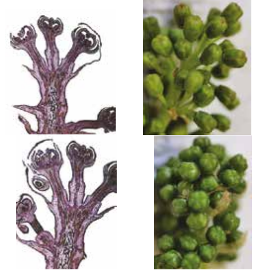
Figure 1. Structural analysis of side branches of an inflorescence histologically (left) and morphologically (right) showing flowers grouped in simple clusters in the following arrangement - the apical part of the side branch terminating in three flowers which have bract rudiments

inflorescence is defined as a varietal characteristic. This aggregation and grouping of flowers in simple botryose inflorescences on side branches in the basal half of the panicle is the result of the progressive shortening of the internodes on the side branches of the inflorescence. Reduction in internode length on side branches which carry simple botryose inflorescences is a variety-specific morphological character in ampelography as it results in variable compactness of the infructescence (the arrangement of berries in the cluster), and at preflowering it can be associated with the mechanical pressure on petals, that is, this compactness among flowers can have a role towards flower caps in terms of flower opening-cap fall.