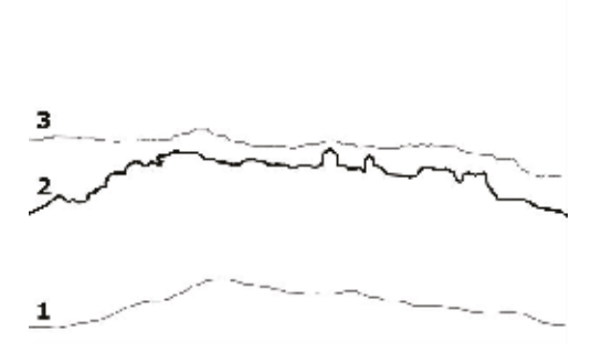
Figure 4c. Removal of background paint for profile decoding.

These studies and researches revealed that by analyzing only the old images and the present photos as a whole we cannot decipher all subtle features.