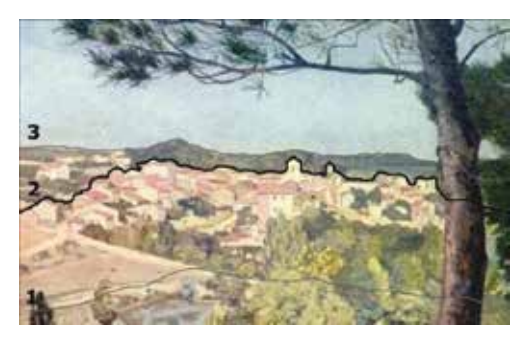
Figure 4b. Drawing the Castelnau-le-Lez profile by overlapping the picture.

The final profile reveals the harmonious integration of all construction into the landscape, suggesting both the beauty of the peaceful life and the attachment to nature. These are the most important features that have contributed to the development of the locality, keeping a tradition of respect for history and the natural environment.