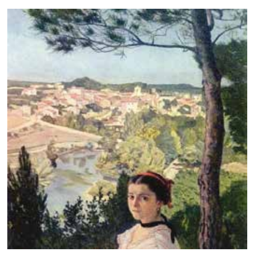
Figure 4a. The final selected painting of Frederic Bazille - View of the Village of Castelnau-le-Lez, 1868

The overall image of the old area is picturesque both as buildings and as a natural landscape. From the historical images were selected, as the most representative, two paintings done by the impressionist artist Frédéric Bazille in 1864 and 1868 (Figure 4a). Both paintings have on their background a gentle image of the quiet settlement. Checking and comparing paintings with current photos revealed that the old 19<sup>th</sup> century core still retained its appearance.