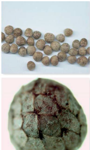
Figure 5. Seeds of Perilla frutescens var. frutescens

The flowers appear in the middle of August, grouped in racemes, and have a white colour. The seeds have a grey colour and the mass of one thousand seeds is 4.26 g (Figure 5).