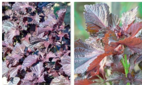
Figure 1. Perilla frutescens var. crispa crop detail

Perilla frutescens var. crispa (Figure 1) has a strong, fibrous-branching root that exploits a large volume of soil. The plant height can reach, on average, up to 2 meters, with a diameter at the base of the stalk measuring, on average, 2.8 cm. The stalk is flexible in the vegetative stages, but it lignifies during the senescence period. The number of main stems varies between 16 and 18.