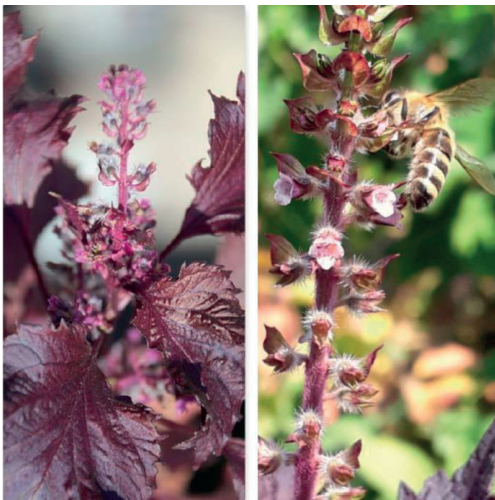
Figure 3. Flowers of P. frutescens var. crispa

The beginning of flowering began on 17 th of August. The plant is self-pollinating, but is preferred by insects, especially bees, due to the pleasant smell (Figure 3). The seeds have a grey colour and in one gram can be found 213 seeds.