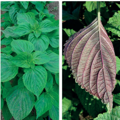
Figure 4. Perilla frutescens var. frutescens crop detail

Perilla frutescens var. frutescens (Figure 4) has a strong root, which exploits a large volume of soil. The stalk is coloured green, with a height of up to 2 meters am with a plant diameter, on average, of 1.33 m. The leaves are green, coloured purple on the side. The average size of the leaflethas a length of 15.93 cm and the width has a value of 9.87. The average number of leaves on the main shoot was 149 leaves.