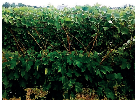
Figure 2. The leaf removal above the bunch area at 'Fetească regală' variety