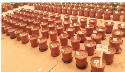
Figure 1: Experimental layout in greenhouse

The experimental treatments were arranged in a 5 \times 3 factorial arrangement in a Randomised Complete Block Design (RCBD) with five replications (Figure 1).