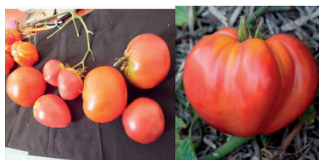
b. Buzău 1600