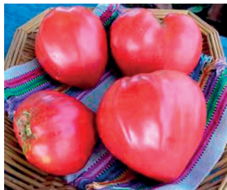
c. Inimă de Bou