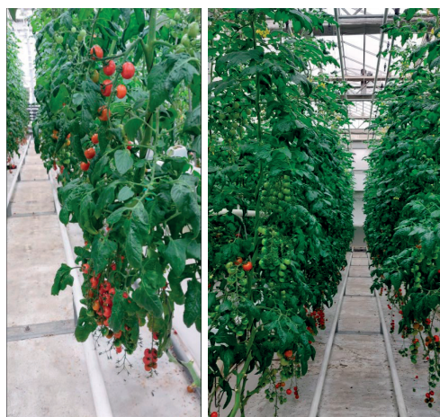
Figure 4. The appearance of the tomato culture, variety Flaviola, on the substrate, in an unconventional system

conventional culture on nutrient substrates (Figure 4).