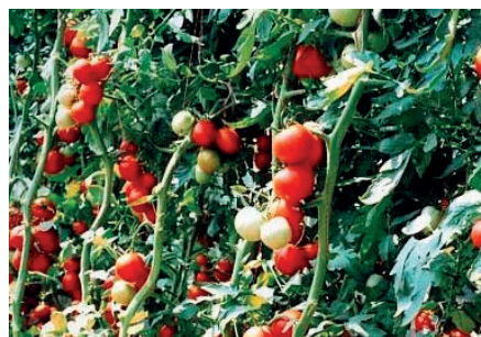
a. Buzău 47

At the Vegetable Research Station in Buzău, more than 20 varieties of tomato were approved, including the varieties Buzău 1600, Siriana and Inimă de Bou. The appearance of the varieties Buzău 47, Buzău 1600 and Inimă de Bou are shown in the Figure 3.