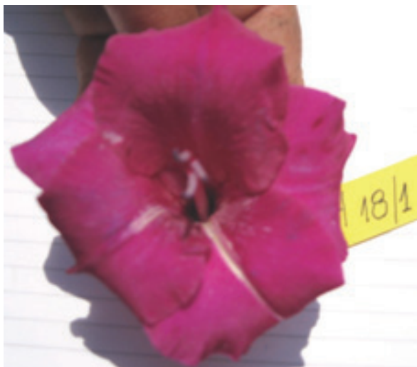
Figure 4. Excelsa (H 18/1)