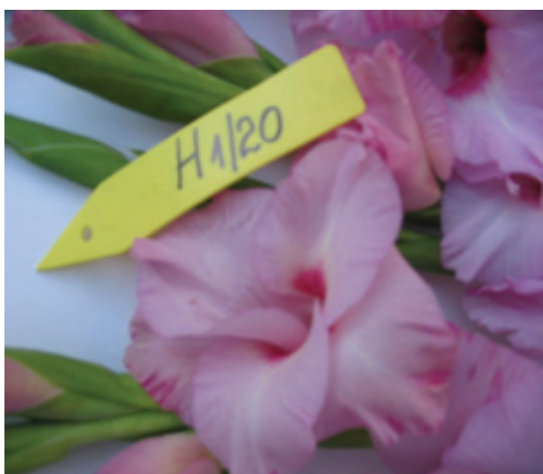
Figure 3. A. Candida Ali (H 1/20)