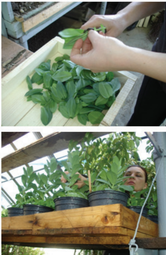
Figure 2. Aspects of in vivo propagation by cuttings (original)