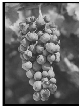
Photo 2. Variety Muscat d'Adda

MUSCAT DE ADDA 22 ȘT. (photo 2.) – has been obtained through clone selection from the variety Muscat d'Adda at INCDBH Ștefănești and homologated in 2008; it is a variety destined for fresh consumption; the leaf is green; the grapes are medium sized, towards large (270-340 g); the berries are disposed equally on the cluster, being medium to large size; semicrisp pulp with specific taste and flavour; the skin is thick, black-aubergine coloured, highly bloomed; the vigour of the vines medium to large; it has good resistance to drought and diseases (mildew, blight and grey rot); the maturation of the grapes in September; a production of 4,9-5,3 kg/vine; it accumulates 187 g/l sugars and 3,9 g/l acidity; it has an increased resistance to handling, transport and storage [1].