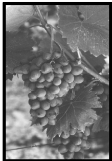
Photo 1. Variety Argessis

ARGESSIS (photo 1.) – variety homologated in 2002 at SCDVV Ștefănești. The first tablegrape variety obtained under the pedoclimatic conditions specific to the vineyard Ștefănești-Argeș. Pleasant commercial aspect, large berry (7,5-8,0 g), ovoidal, bluish-black colour. Large, uniaxial grape(450-480 g). Good tolerance to cryptogamic diseases (mildew, blight, rot). High vigour vines, suitable for arbour culture. Average production reaches 15 t/ht [7,8].