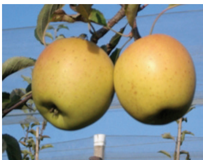
Photo 2. Goldrush apple

The fruit sizes varied from 173.3 g at Goldrush to 232.0 g at Topaz. Goldrush produced also the highest number of fruits per tree (70) and highest fruit yield (34.65 t/ha) followed by Topaz with 27.14 t/ha (Table 3).