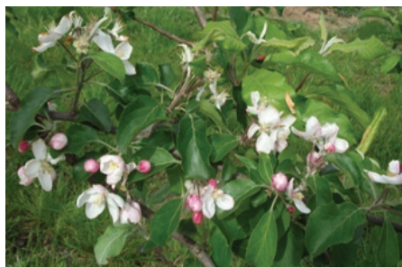
Photo 1. Topaz flower

The fruit sizes varied from 173.3 g at Goldrush to 232.0 g at Topaz. Goldrush produced also the highest number of fruits per tree (70) and highest fruit yield (34.65 t/ha) followed by Topaz with 27.14 t/ha (Table 3).