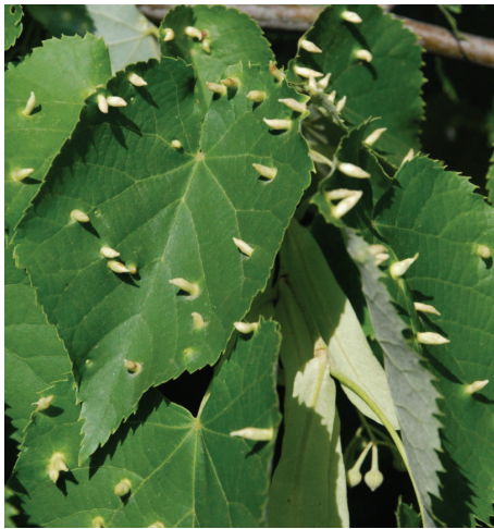
Photo 2. Eriophyes tiliae tiliae on Tilia tomentosa