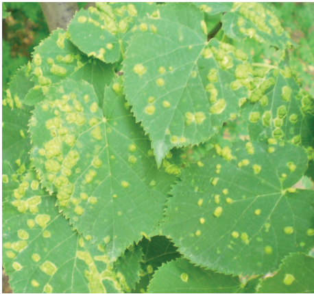
Photo 3. Eriophyes tiliae rudis on Tilia tomentosa

Eriophyes triradiatus Nal. was found on Salix babylonica (Photo 4) and S. matsudana "Tortuosa" (Photo 5).