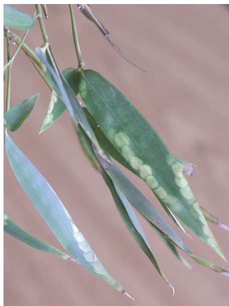
Photo 7. Schizotetranychus celarius on Phyllostachys aureosulcata (leaves with variegated aspect)