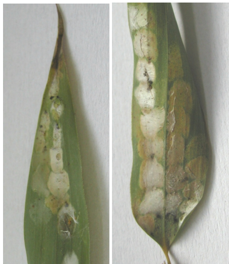
Photo 6. Schizotetranychus celarius on Phyllostachys aureosulcata (white web, in the shape of a nest)

with time on. The attack of this species has manifested in 2008 and 2009 but it hasn't been present in 2010 and 2011.