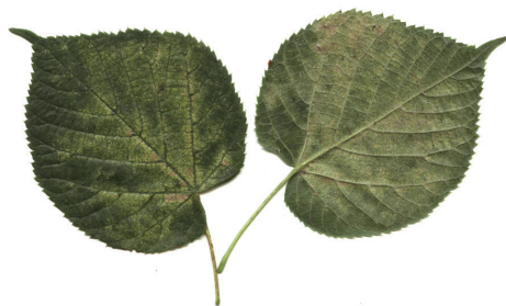
Photo 1. Eotetranychus tiliarium on Tilia cordata

Eotetranychus tiliarium Hermann represented the most spread specie at the linden plants and with a strong impact on the ornamental value of the plants. The attack manifested itself strongly on the trees planted in a row, the asphalt effect contributing to the pest installation. The first pests were settled at the bottom of the trees and where the branches of the adjoining trees intersect. The leaves of these trees become grey-yellowish and in the middle of summer they were completely withered (Photo. 1). Also, high temperatures and excessive drought favoured the attack of this species. The trees planted isolated in parks were not attacked by this mite. As regards the preference for the host plant, this proved to be the specie Tilia cordata . In 2008, 86 trees of Tilia cordata were examined, in 2009 their number decreased to 78, in 2010 to 75 and in 2011, 71 trees. These were eliminated as a result of their withering, caused by the complex – mites, draught, sensitivity to pollution.